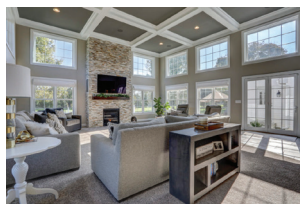
Best Whole House Remodel $250,000 - $500,000 Metzler Home Builders, Inc.