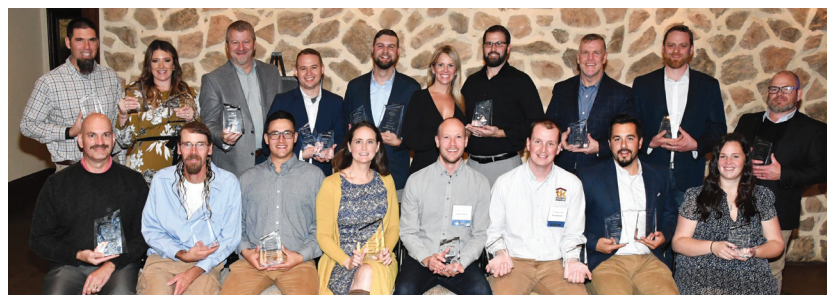
Congratulations to all our Pillar Award winners!