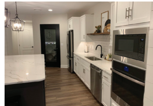
Best Basement Remodel Over $100,000 Garman Builders, Renovations