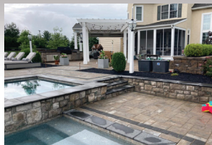
Best Outdoor Living Project Over $100,000 Garman Builders, Renovations