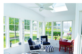
Best Outdoor Living Project Under $50,000 Eby Exteriors