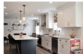
Best Kitchen Remodel Under $50,000 Jemson Cabinetry, Inc.