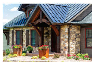
Best Exterior Project Over $100,000 TK Building & Design LLC