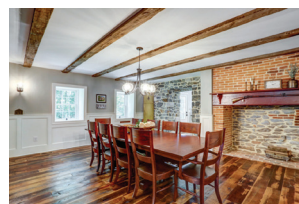
Best Whole House Remodel Over $500,000 Garman Builders, Inc.