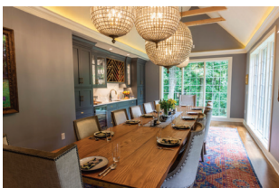
Best Interior Project $50,000 - $100,000 TK Building & Design LLC