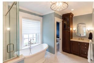
Best Bathroom Remodel $50,000 - $100,000 TK Building & Design LLC