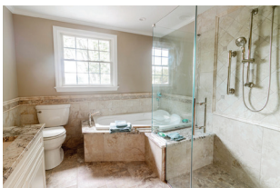
Best Bathroom Remodel Under $50,000 TK Building & Design LLC