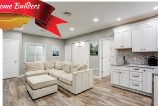
Best Basement Remodel Under $100,000 Metzler Home Builders, Inc.