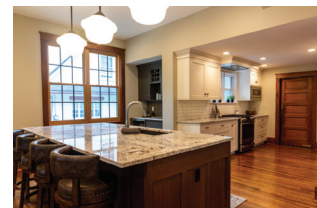
Best Addition over $250,000 TK Building & Design LLC