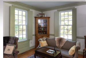
Best Specialty Project Eby Exteriors