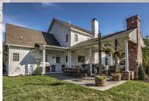
Best Outdoor Living Project $50,000 - $100,000 Metzler Home Builders, Inc.